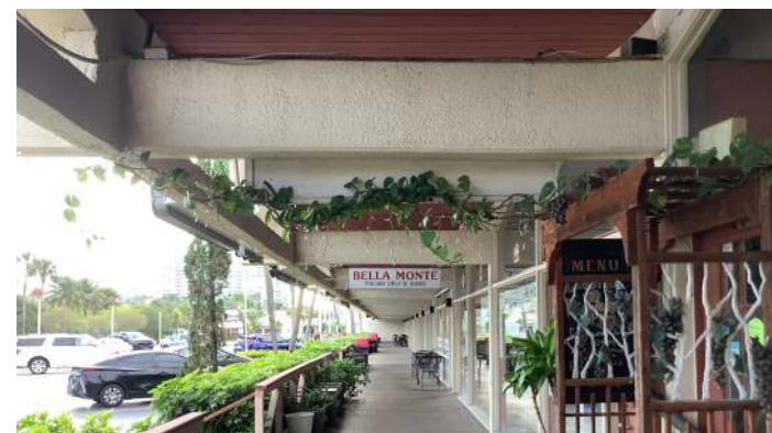
UNDER CANOPY SIGN - SIDE 2